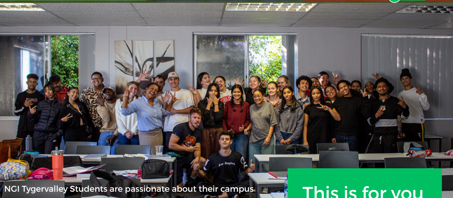
NGI Tygervally Students are passionate about their campus.